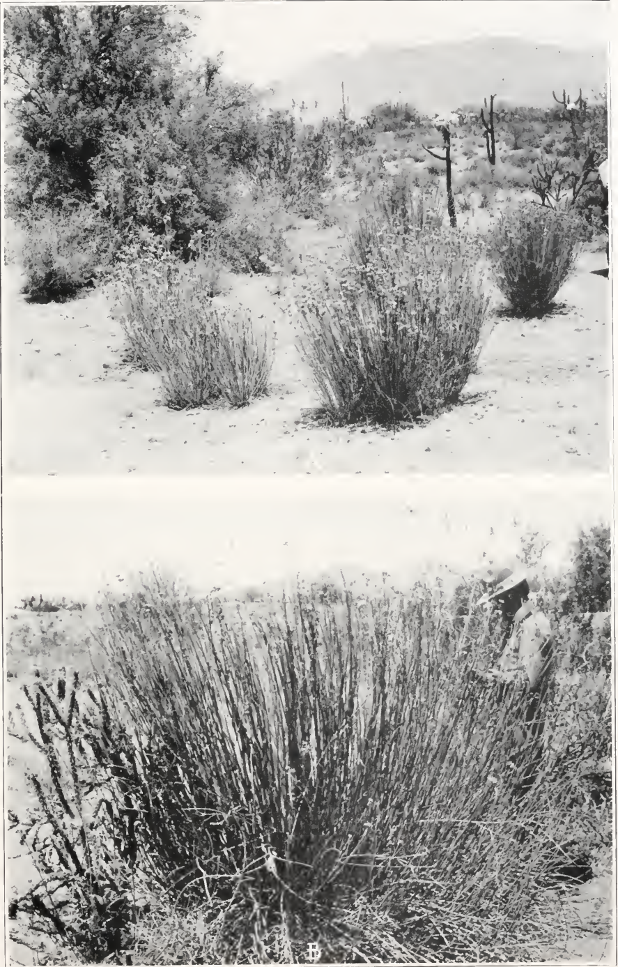
A. Community of Asclepias subulata in an arroyo near Mesa, Arizona. B. Individual plant of A. subulata , showing maximum size in nature.